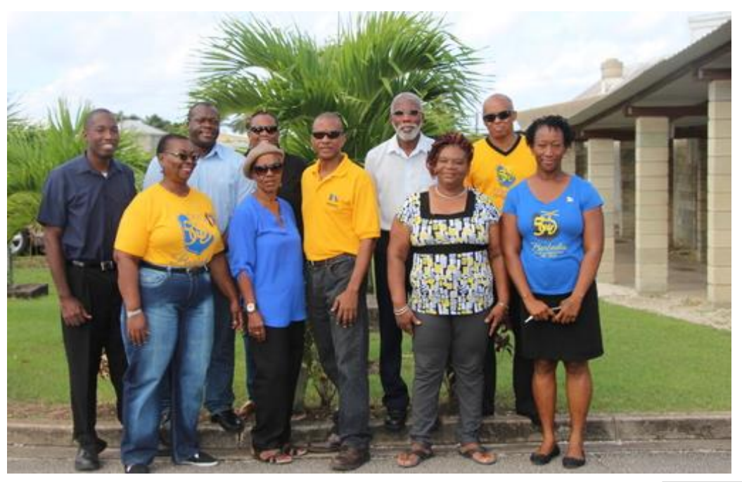
SJPI staff. Independence celebrations. November 2016

This handbook will provide you with information about the SJPI and give you details about student services, academic regulations, disciplinary matters and other general information which will be of importance to you.