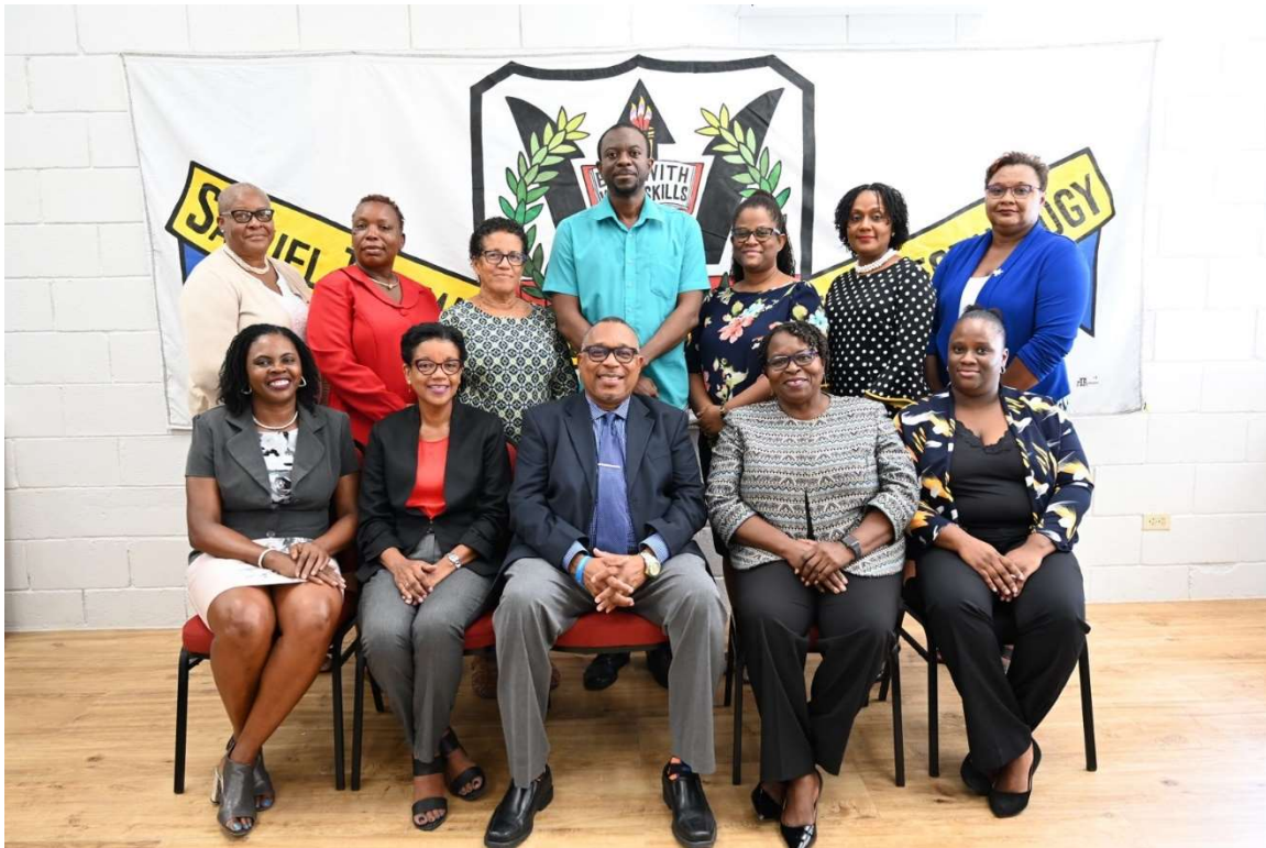
SJPI Management Team