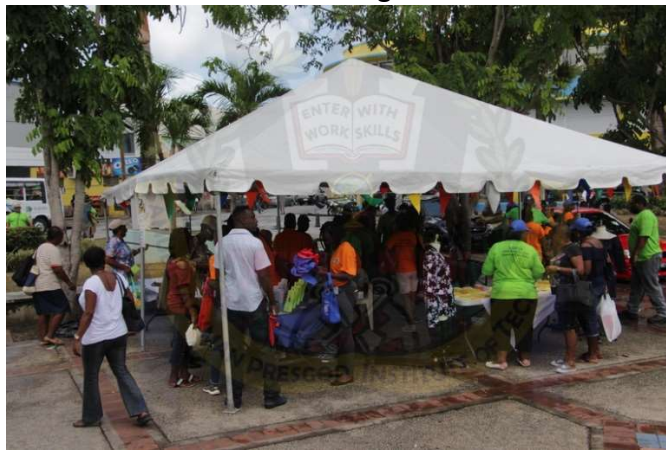
DCE/OFL Motorcade Saturday, 13 July 2019

The Division of Distance & Continuing Education / Open & Flexible Learning Centre delivers part-time courses and programmes, customized training and manages the online platform used to deliver blended learning.